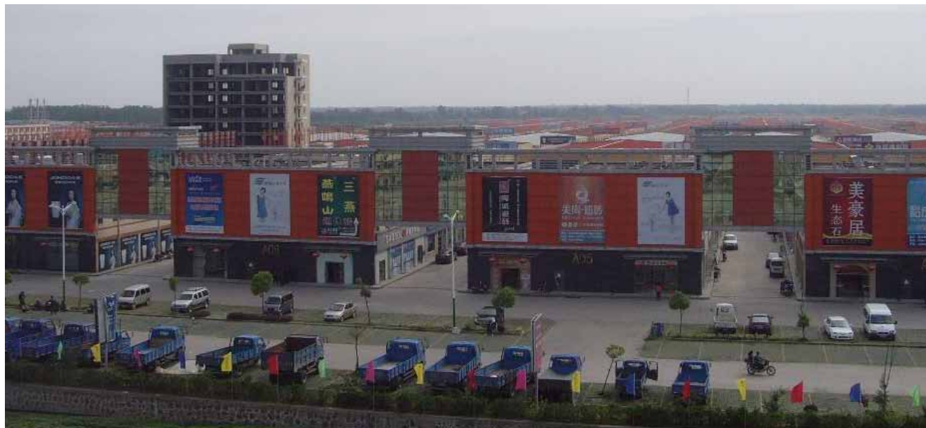
Golden Sun Home Décor City is the area's largest trade and warehousing facility for home décor and building materials.

According to the Lai'an county government's 12 th five-year plan (2011-2015), the park