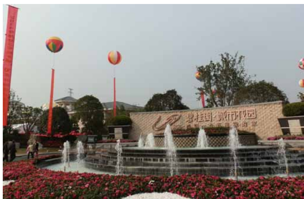
Country Garden is investing 40 billion in building a large residential community in Chahe.

of roads, put up 12 bridges, fixed 820 street lamps, and laid down 19.3 km of water pipes, and 19.9 km of telecommunication cables.