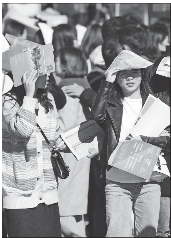
Graduates attend a career fair at Yunnan Minzu University in Kunming, Yunnan province, last month. More than 5,000 positions were being offered.